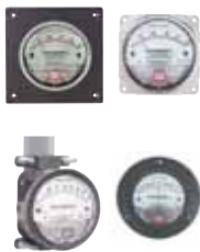
Flush, Surface or Pipe Mounted

Note: May be used with hydrogen. Order a Buna-N diaphragm. Pressures must be less than 35 psi.